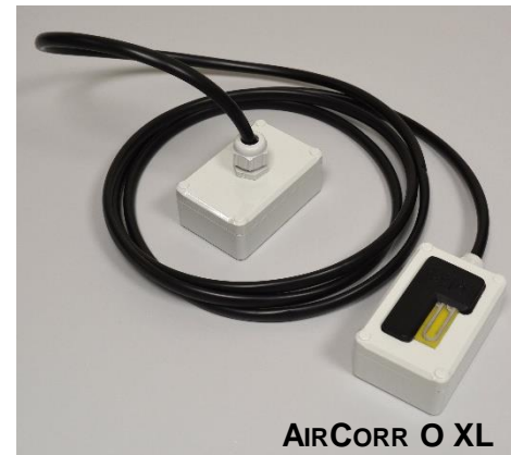
AIRCORR O XL