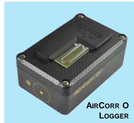
AIRCORR O LOGGER