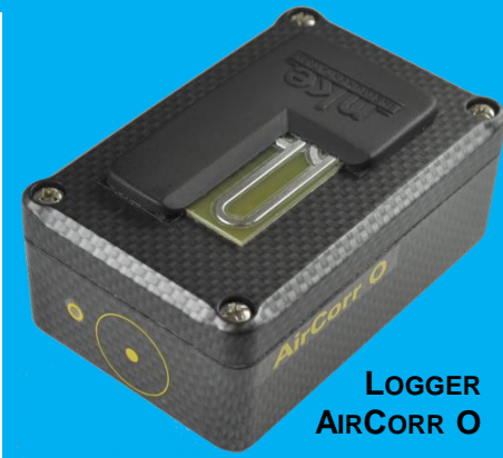
LOGGER AIRCORR O