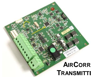
AIRCORR T TRANSMITTER