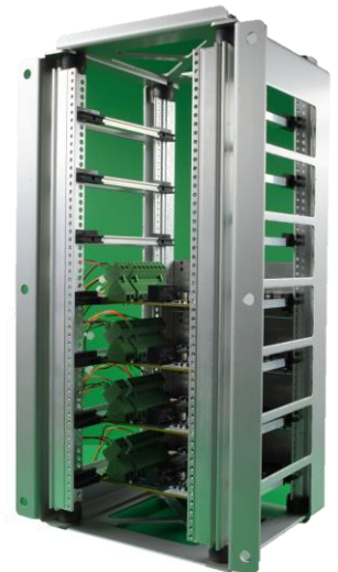
RACK OF AIRCORR T TRANSMITTERS