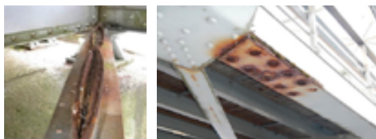
Figure 1. To the left: cross sectional beam with pack rust and ongoing crevice corrosion. To the right: edge beam with

The planned continuation of this project includes corrosion testing of promising alternative corrosion protection strategies. And proof of concept studies of new ideas for proactive maintenance that this study has resulted in.